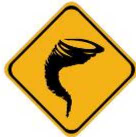
COMMUNITY SAFE ROOM FLOOR PLANS

The Community Safe Room is opened when the National Weather Service issues a tornado watch or a severe thunderstorm watch for our area. The safe room will operate for a minimum time period. The safe room intention is not to be used for long-term housing and is not equipped to considerable mass care such as meals, showers and cots.